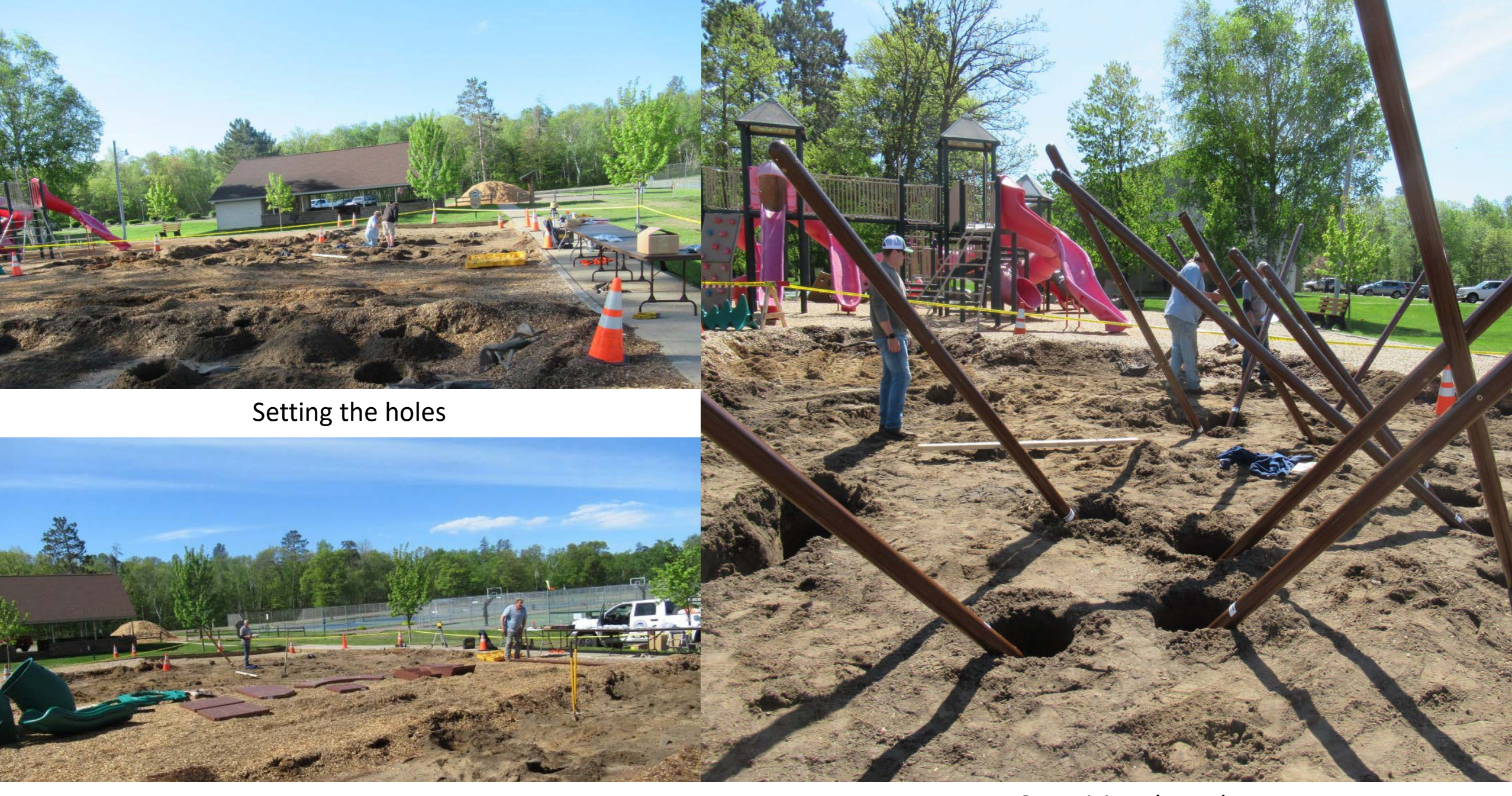
Laying out the decking